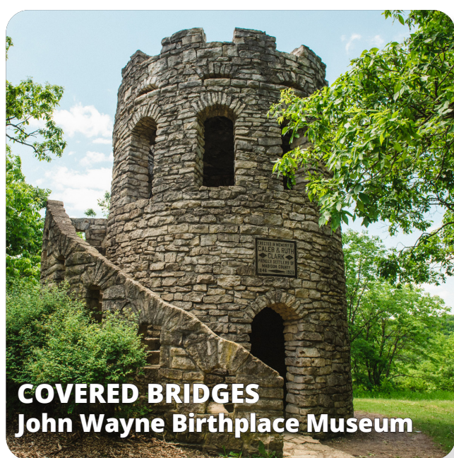
COVERED BRIDGES John Wayne Birthplace Museum

From east to west and north to south, our state is FILLED with the most beautiful locations and hidden gems. Take a look at each of these featured spots along all of the Iowa byways. Where are you going next?