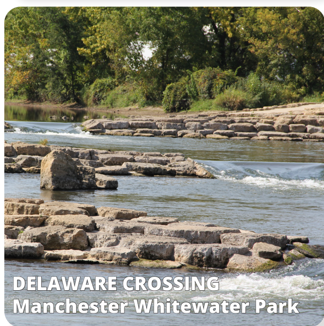
DELAWARE CROSSING Manchester Whitewater Park